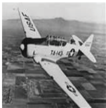
OLD T-6 OVER KOREA IN BACKGROUND