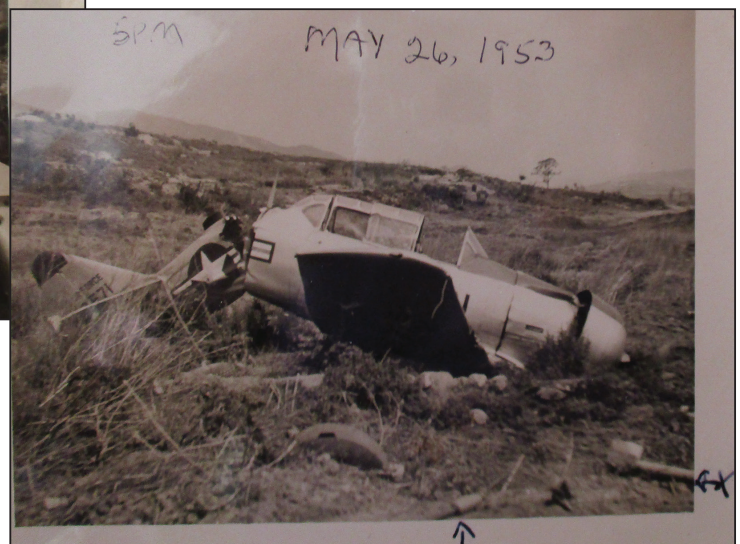
LTA-571 from opposite side